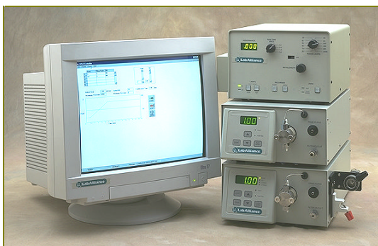
Series III Binary Gradient System

When combined with a Series II or III pump, keypad controller, detector, and injector, you have an economical, flexible binary gradient system.